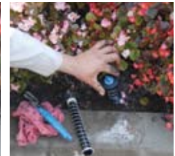
Drop in I-PRO replacement and retrofit is complete