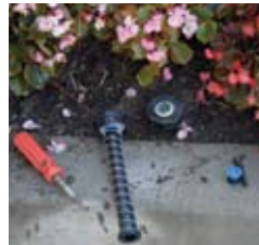
Easily retrofits to Rain Bird 1800 Series

Why pay for a body you're just going to throw away? I-PRO offers a 4" and 6" replacement spray head that is everything but the body! Ideal for maintenance, this spray head also fits right in the can of the Rain Bird® 1804 & 1806 spray head for an easy retrofit. With features that are contractor-driven and field-proven, the I-PRO Series is sure to save you time and money.