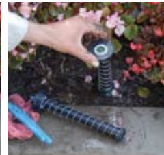
Remove the "guts" of 1806 spray head